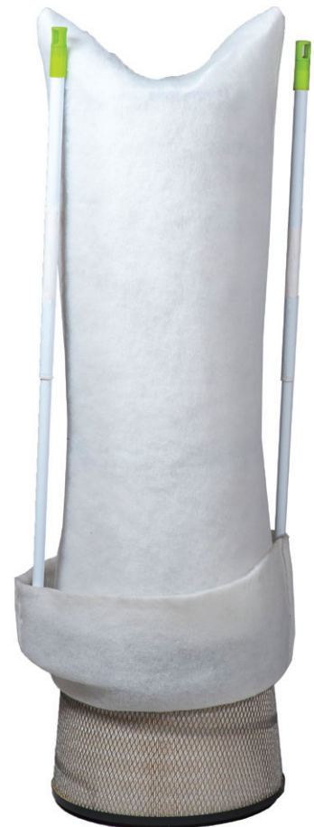
* Optional installation tool available